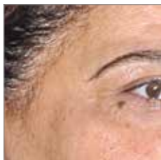
AFTER 3 WEEKS